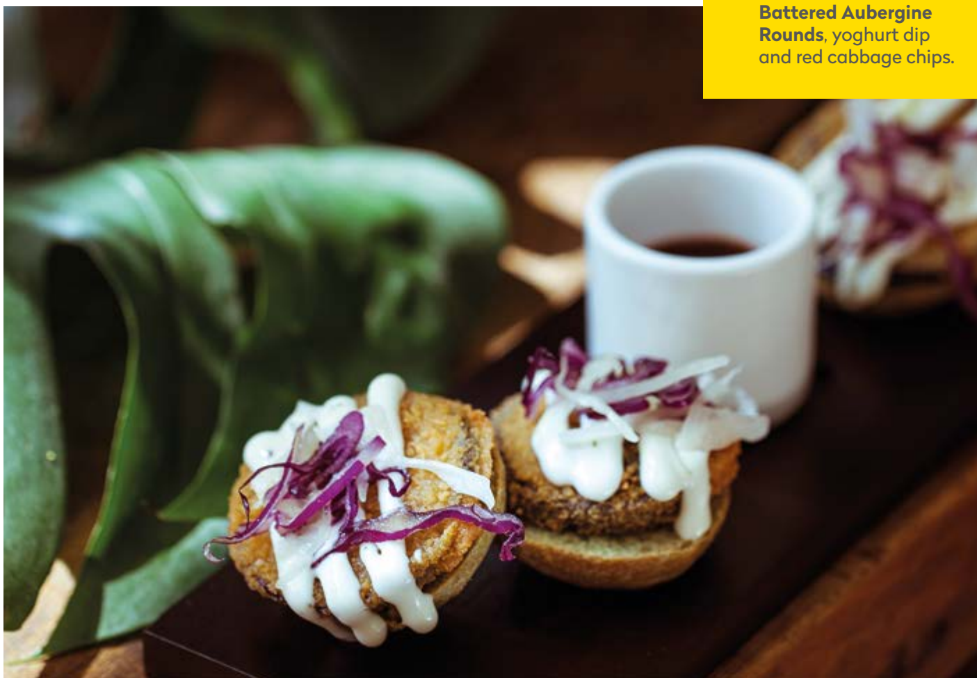
Bruschetta with Battered Aubergine Rounds , yoghurt dip and red cabbage chips.

INGREDIENTS Courgettes, auber- gines, bell peppers, sunflower oil.